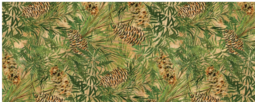
24177-14 | Pine and Fern Toss | Cream Multi