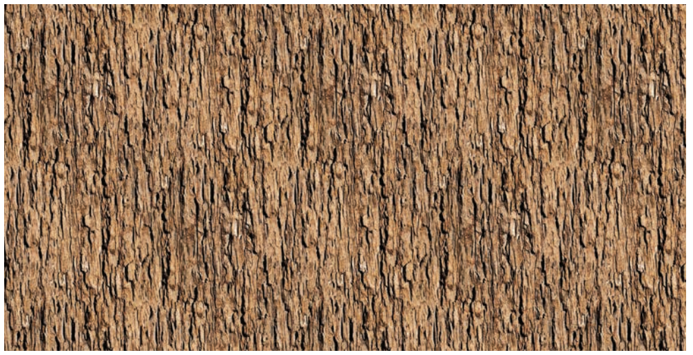
24182-36 | Bark Texture | Brown