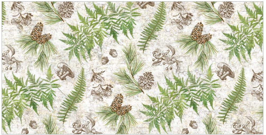
24175-12 | Fern and Toile Toss | Cream