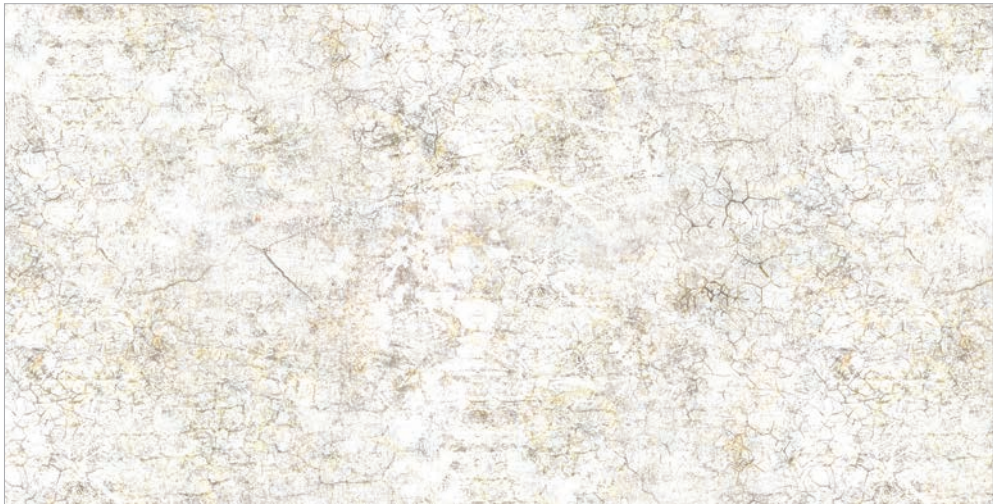
24181-12 | Grunge Texture | Tan