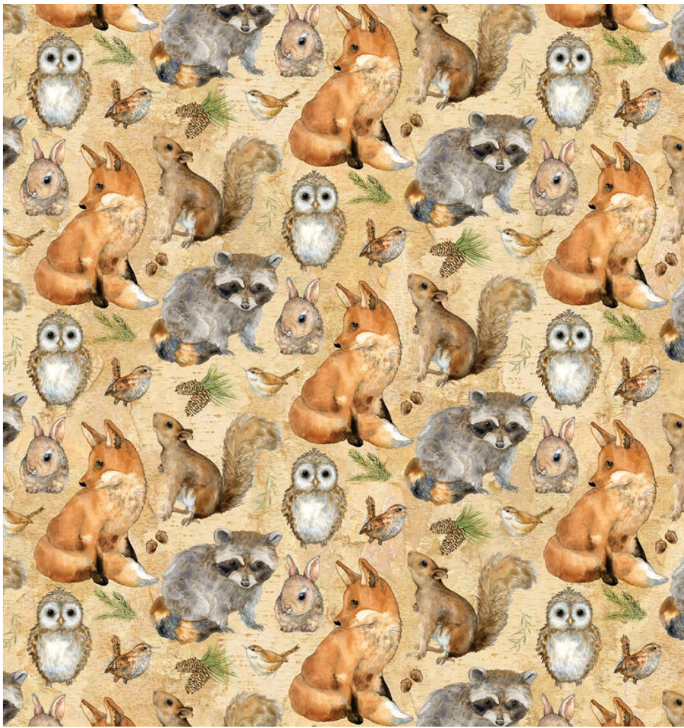
24173-14 | Animals | Tan Multi