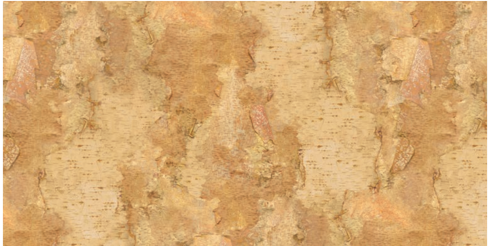
24180-14 | Birch Texture | Tan