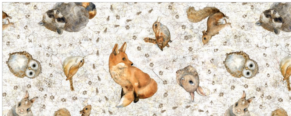
24174-12 | Animal and Footprint Toss | Cream Multi