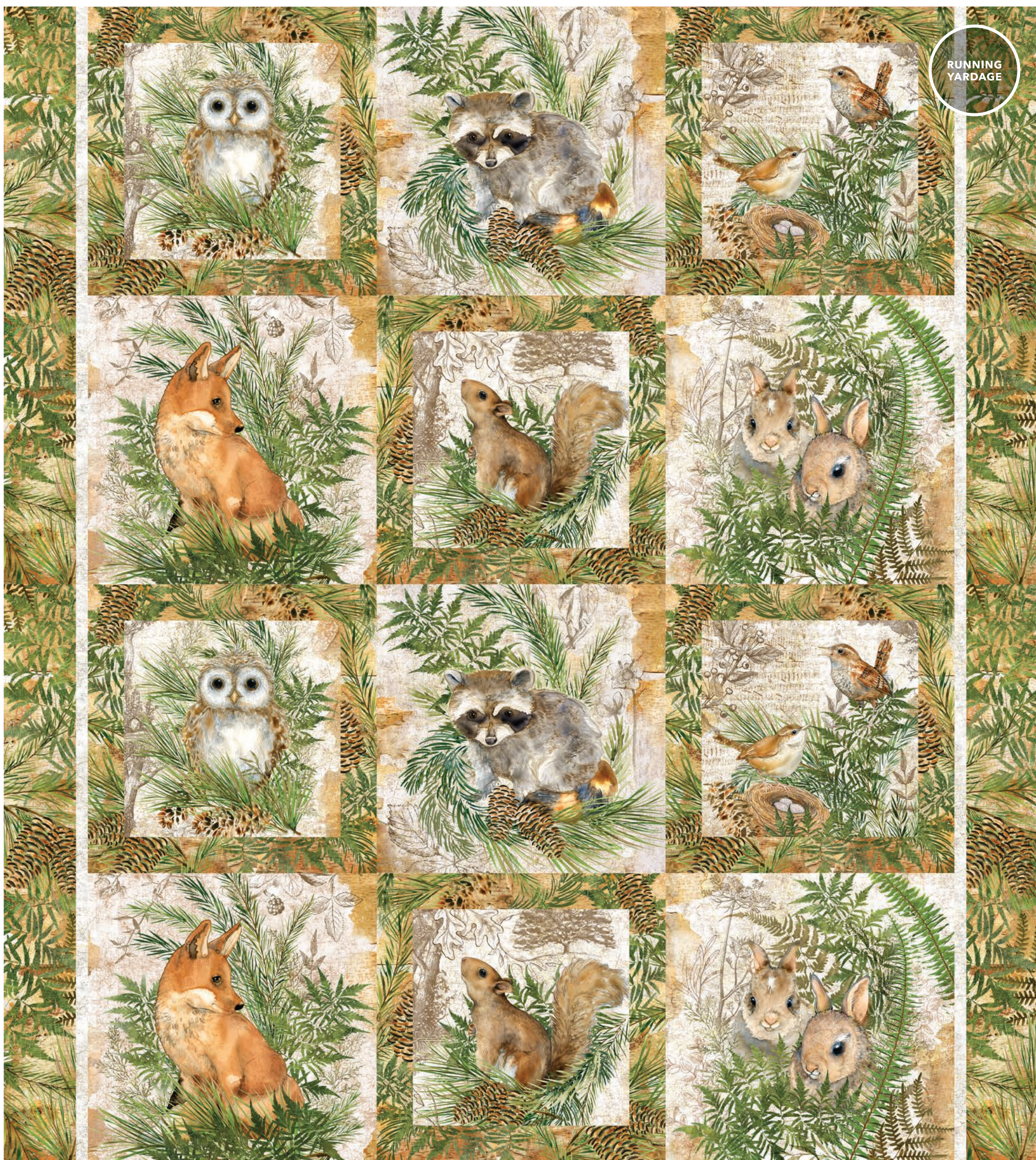
24172-12 | Forest Babies (Running Yardage) | Cream Multi