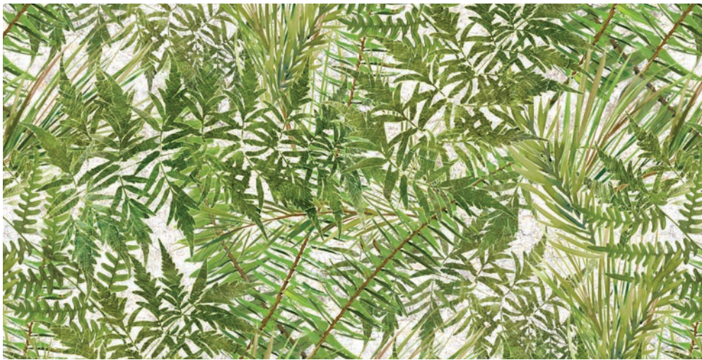
24176-74 | Fern Toss | Green